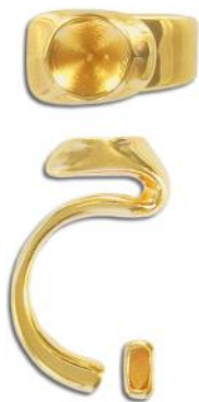
FR583/GL ID 4.9x2.3mm setting SS39 stone