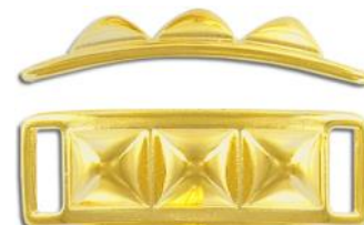
CN143/GL 40x14mm ID 3x10mm