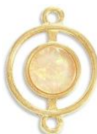
SPCN1690/GL 25mm coquillage synthétique blanc iridescent synthetic iridescent white shell