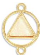
SPCN1689/GL 25x18mm coquillage synthétique blanc iridescent synthetic iridescent white shell