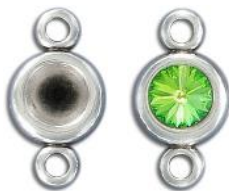
CN437/OXWH 12mm s'adapte à tous 1122/SS39/ fits all 1122/SS39/