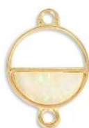
SPCN1691/GL 16mm coquillage synthétique blanc iridescent synthetic iridescent white shell