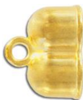
CE716/GL 25 x 20mm ID 2 x 10mm