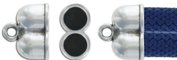
CE716/OXWH 25x20mm ID 2 x 10mm