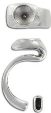
FR583/OXWH ID 4.9x2.3mm setting SS39 stone