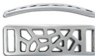
CN131/OXWH 40x14mm ID 3x10mm