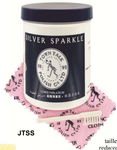
taille réduite reduced in size