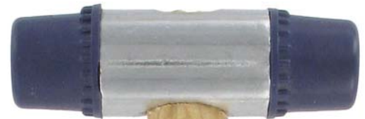
JTAWHAMMER 24.5cm, (6")