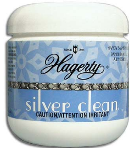
JTHSS 7 cm (W) x 8.5 cm (H) 2.25" (W) x 3" (H) grandeur réduite reduced in size