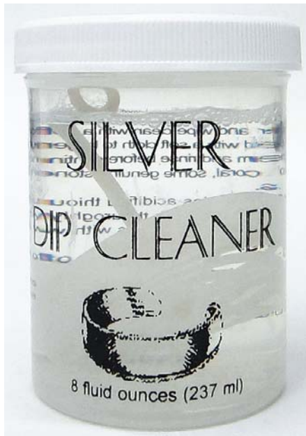
taille réduite reduced in size