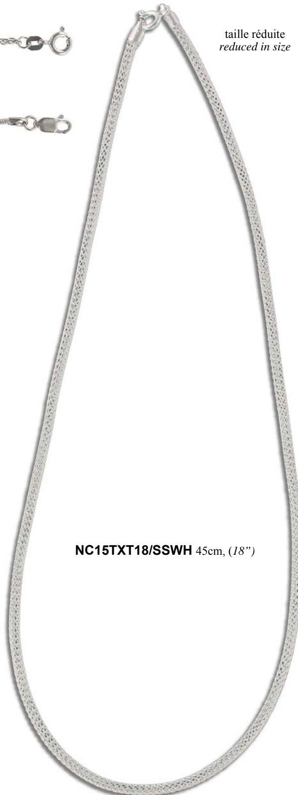
NC15TXT18/SSWH 45cm, (18")