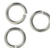
JR10MM14/SS OD 10mm 1.4mm, (15ga)