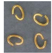
JR7X5MM/GL 7x5mm 0.85mm, (20ga)