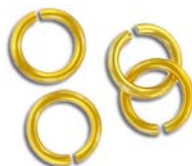
JRA10MM/GL 10mm 14ga, (1.6mm)