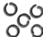
JR6MM/BSS 6mm 18ga, (1mm)