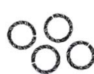
JR8MMF/BN 8mm 17ga, (1.2mm)