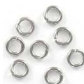
JR5MM10/SS 5mm 1mm, (18ga)