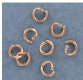
JR4MM07/RSS 4mm 21ga, (0.7mm)