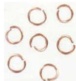
JR5MM07/RSS 5mm 21ga, (0.7mm)