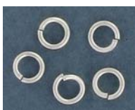
MSPL plaqué argent mat matt silver plate