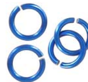
JRA10MM/ROY 10mm 14ga, (1.6mm)