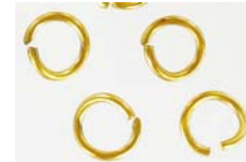
JR8MM/GSS 8mm 17ga, (1.2mm)