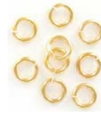
JR5MM09A/HGL 5mm 0.9mm, (19ga) or hamilton hamilton gold made in US