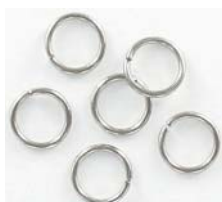
JR8MM10/SS 8mm 1mm, (18ga)