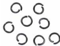
JR5MM08/BSS 5mm 0.8mm, (20 ga)