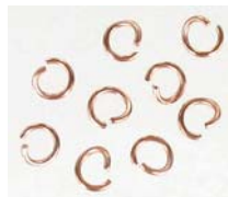
JR5MM08/RSS 5mm 20ga, (0.8mm)