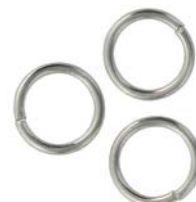
JR12MM/SS OD 12mm 1.4mm, (15ga)