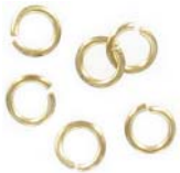
JR6MM10/RAW 6mm 1mm, (18ga) base de laiton brass core