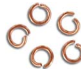
JR6MM/RSS 6mm 18ga, (1mm)