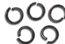
JR8MM/BSS 8mm 17ga, (1.2mm)