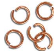
JR8MM/RSS 8mm 17ga, (1.2mm)