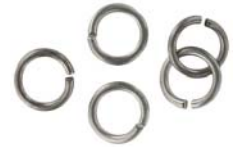
JR8MM/SS OD 8mm 1.2mm, (17ga)