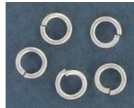
MSPL plaqué argent mat matt silver plate