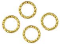
JR8MMF/GL 8mm 17ga, (1.2mm)