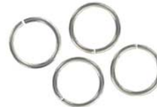
JR10MM10/WH 10mm 18ga, (1mm)