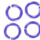
JRA7MM/PUR 7mm 18ga, (1mm)