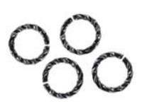
JR8MMF/BN 8mm 17ga, (1.2mm)