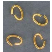
JR7X5MM/GL 7x5mm 0.85mm, (20ga)