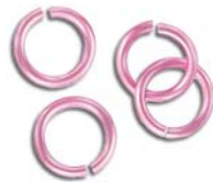
JRA10MM/PK 10mm 14ga, (1.6mm)