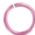
JRA18MM/PK 18mm 10ga, (2.4mm)