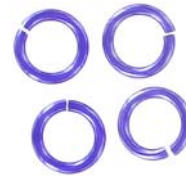
JRA10MM/PUR 10mm 14ga, (1.6mm)