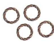
JR8MMF/OXCO 8mm 17ga, (1.2mm)