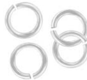
JRA10MM/SPL 10mm 14ga, (1.6mm)