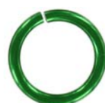
JRA18MM/GRN 18mm 10ga, (2.4mm)