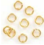
JR4MM08A/HGL 4mm 0.8mm, (20ga) or hamilton hamilton gold made in US