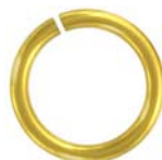
JRA18MM/GL 18mm 10ga, (2.4mm)