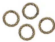
JR8MMF/OXBR 8mm 17ga, (1.2mm)