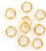
JR5MM09A/HGL 5mm 0.9mm, (19ga) or hamilton hamilton gold made in US