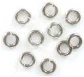
JR4MM09A/WH 4mm 0.9mm, (19ga) made in US