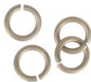
JRA10MM/CHAM 10mm 14ga, (1.6mm)