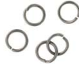
JR6MM10/SS OD 6mm 0.8mm, (20ga)