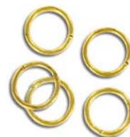
JR10MM10/GL 10mm 18ga, (1mm)