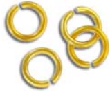
JRA7MM/GL 7mm 18ga, (1mm)