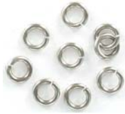
JR5MM10A/WH 5mm 1mm, (18ga) made in US