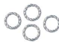
JR8MMF/SPL 8mm 17ga, (1.2mm)