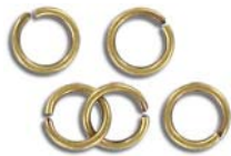
JR8XB OD 8mm 17ga, (1.2mm)