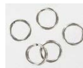
DR6MM/SS acier inoxydable stainless steel