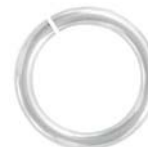
JRA18MM/SPL 18mm 10ga, (2.4mm)