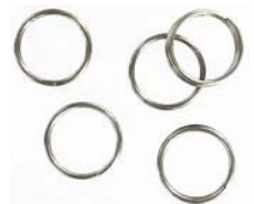
DR9MM/SS acier inoxydable stainless steel