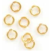
JR5MM10A/HGL 5mm 1mm, (18ga) or hamilton hamilton gold made in US