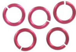
JRA10MM/RED 10mm 14ga, (1.6mm)