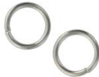
JR12MM/SS 12mm 15ga, (1.4mm)