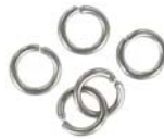
JR6MM08/SS OD 6mm 1mm, (18ga)