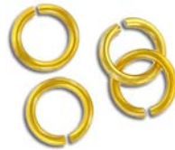
JRA10MM/GL 10mm 14ga, (1.6mm)