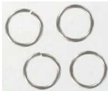
JR10MM10/SS 10mm 18ga, (1mm)