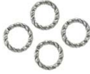
JR8MMF/WH 8mm 17ga, (1.2mm)