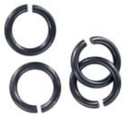
JRA10MM/BN 10mm 14ga, (1.6mm)