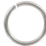
JR20MM/SS 20mm 12ga, (2mm)