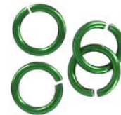
JRA10MM/GRN 10mm 14ga, (1.6mm)