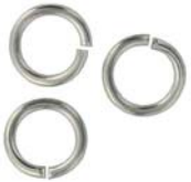
JR10MM/SS OD 10mm 15ga, (1.4mm)