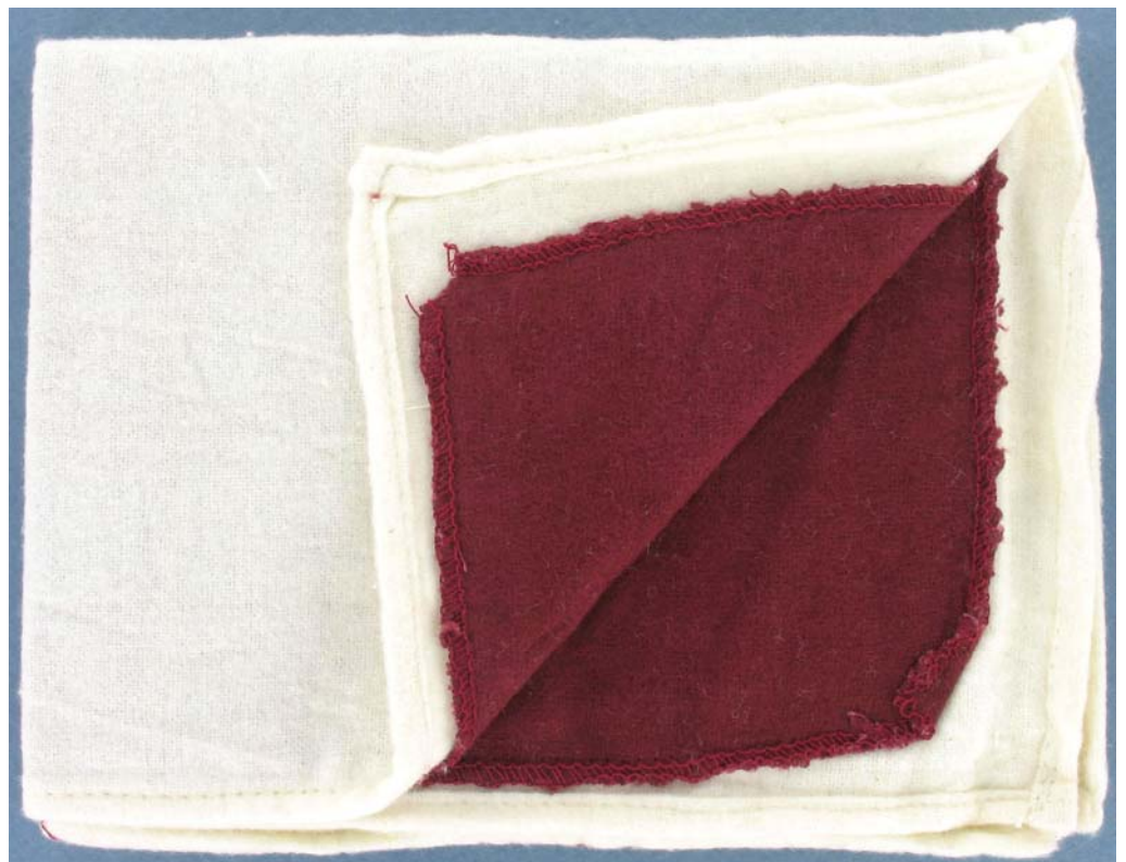
taille réduite reduced in size