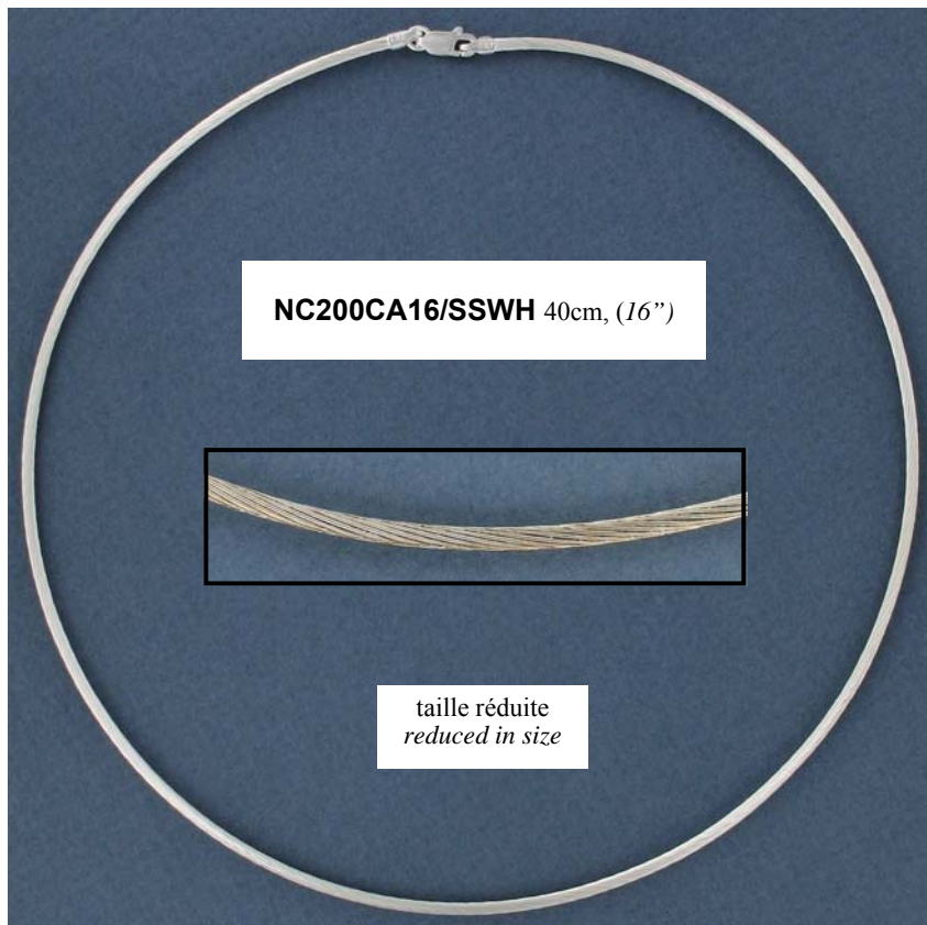
NC200CA16/SSWH 40cm, (16")