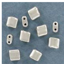
GBSQ5X5/01700 5x5mm ID approx. 0.8mm perles en verre argent/silver glass beads