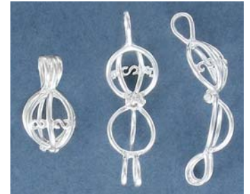
MP6966/SSWH pendentif cage pour billes 6mm cage fits 6mm bead