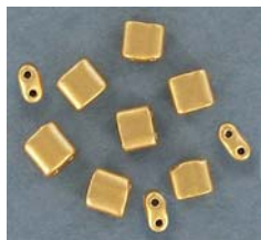
GBSQ5X5/01710 5x5mm ID approx. 0.8mm perles en verre or/gold glass beads