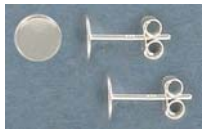
EP3160/SSWH 6mm plateau/pad