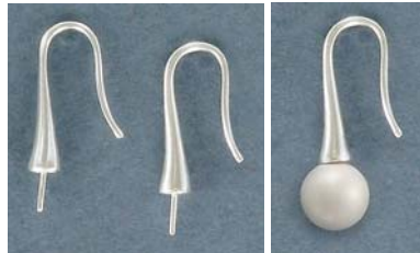
EW407/SSWH 18mm, avec poteau 5mm 18mm with 5mm post 0.7mm, (23ga)