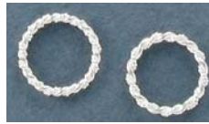
JRS12MMT/SSWH 12mm 1.5mm, (15 ga) soudé/soldered