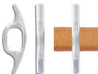
MB10X7166/OXWH 28x3mm ID 10x6mm