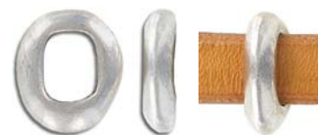
MB10X799/OXWH 16x13mm ID 10x6mm