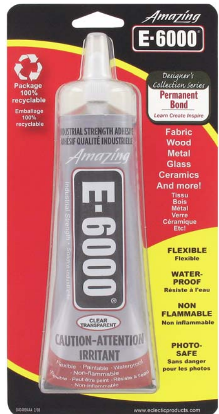
JG6000R 59.15 ml (2 FL. OZ.)