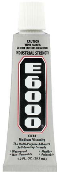
JG6000S 29.7 ml (1 FL. OZ.)