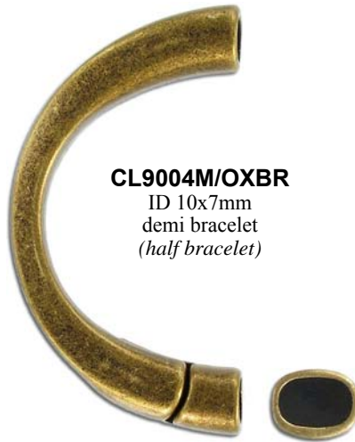
CL9004M/OXBR ID 10x7mm demi bracelet (half bracelet)