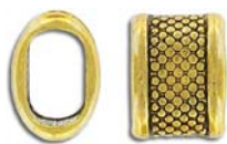
MB10X720/OXGL 14x11mm ID 10x 7mm