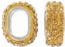
MB10X6/215 19x8mm ID 10x7mm topaze colorado clair light colorado topaz