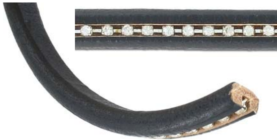
TT10X6/101/BLK 10x6mm, 1 meter noir/black cristal/crystal