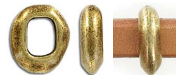
MB10X799/OXBR 16x13mm ID 10x6mm