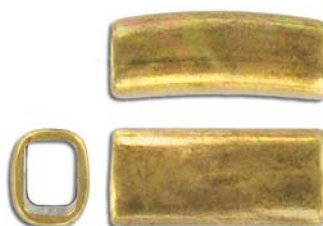
MB060/OXBR ID 10x7mm