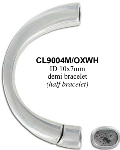
CL9004M/OXWH ID 10x7mm demi bracelet (half bracelet)