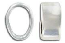
MB005/OXWH ID 10x7mm