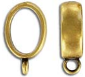
MBL091/OXBR ID 10x7mm