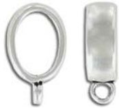
MBL091/OXWH ID 10x7mm