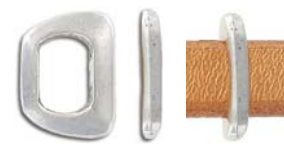
MB10X7101/OXWH 14x10mm ID 10x6mm