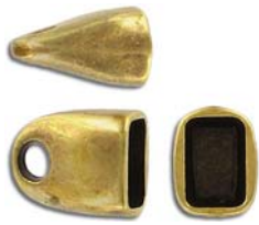
CE10X7MM/OXBR 15x13mm ID 10x7mm