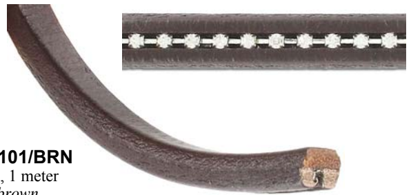
TT10X6/101/BRN 10x6mm, 1 meter brun/brown cristal/crystal