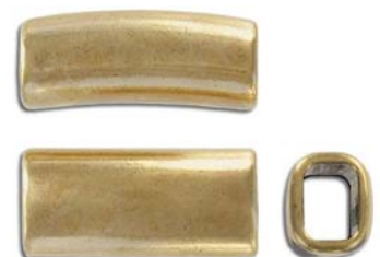
MB526/OXGL 28x13mm ID 10x7mm