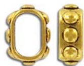
MB10X788/OXGL 15x6mm ID 10x 7mm