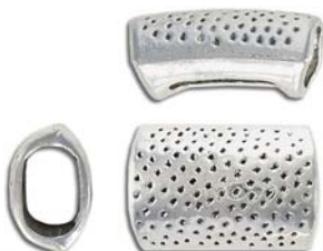
MB10X7108/OXWH 20x14mm ID 10x6mm