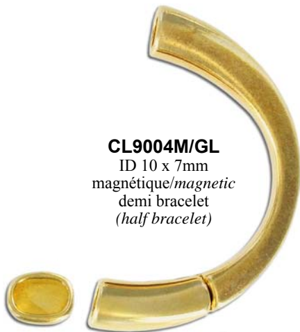
CL9004M/GL ID 10 x 7mm magnétique/magnetic demi bracelet (half bracelet)