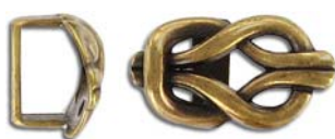
MB067/OXBR 21x11.5mm ID 10x7mm