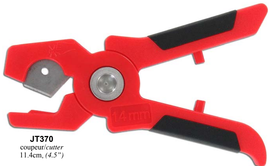
JT370 coupeur/cutter 11.4cm, (4.5")

The cutter is excellent for use on Licorice Leather, rubber cord, leather cord and rope. The cutter is not for cutting metals such as craft wire, memory wire or chain which can damage the blade.