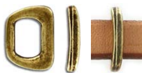
MB10X7101/OXBR 14x10mm ID 10x6mm