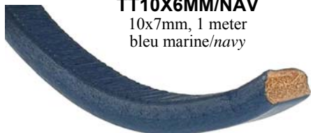
TT10X6MM/NAV 10x7mm, 1 meter bleu marine/navy