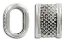
MB10X720/OXWH 14x11mm ID 10x 7mm