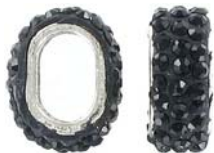
MB10X6/212 19x8mm ID 10x7mm jais/jet