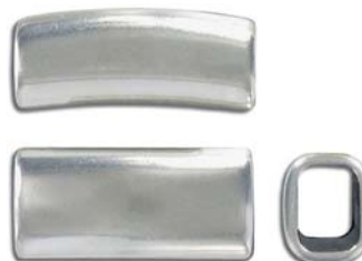
MB526/OXWH 28x13mm ID 10x7mm