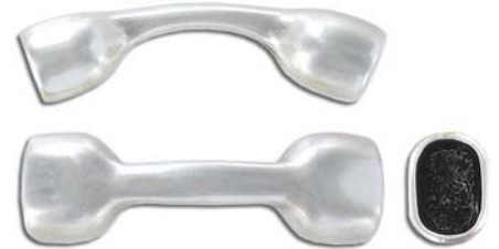
CN117/OXWH ID 10x7mm