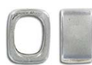
MB10X783/OXWH 14x8mm ID 10x 7mm