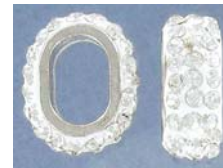
MB10X6/101 19x8mm ID 10x7mm cristal/crystal