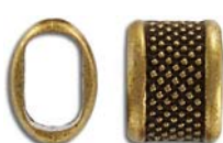
MB10X720/OXBR 14x11mm ID 10x 7mm