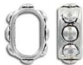
MB10X788/OXWH 15x6mm ID 10x 7mm