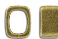
MB10X783/OXBR 8x14mm ID 7x10mm