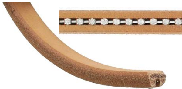
TT10X6/101/NAT 10x6mm, 1 meter naturel/natural cristal/crystal

Le coupeur est conçu pour utiliser avec du cuir Licorice, du cordon en cuir et caoutchouc, et de la corde. Le coupeur n'est pas fait pour couper des métaux comme du fil d'artisanat, du fil de mémoire, ou de la chaîne qui pourrait endommager la lame.