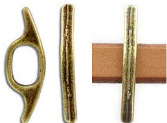
MB10X7166/OXBR 28x3mm ID 10x6mm