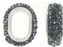
MB10X6/204 19x8mm ID 10x7mm diamant noir black diamond