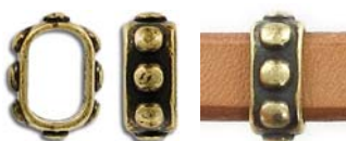
MB10X788/OXBR 15x6mm ID 10x7mm