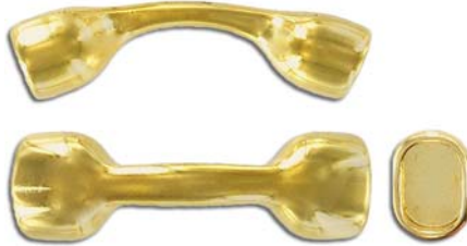
CN117/GL ID 10x7mm