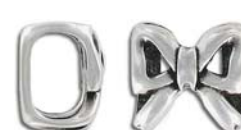
MB119/OXWH 15x13mm ID 10x7mm