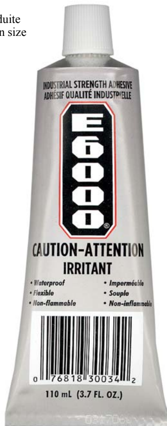
JG6000 110 ml (3.7 FL. OZ.)