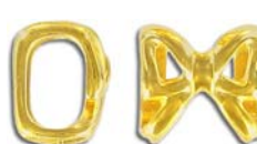
MB119/GL 15 x 13mm ID 10x7mm