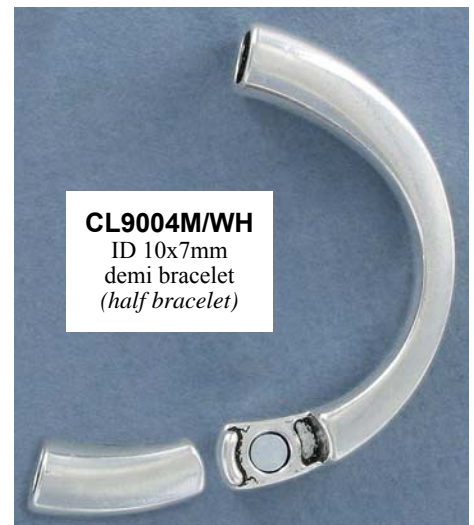
CL9004M/WH ID 10x7mm demi bracelet (half bracelet)