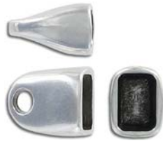
CE952/OXWH 15x13mm ID 10x7mm