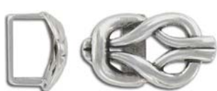
MB067/OXWH 21x11.5mm ID 10x7mm